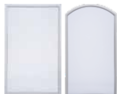
PICTURE AND RADIUS

Awning windows are hinged on top and open outward, enabling ventilation without letting in rain or falling leaves. They are a great choice to pair with non-operable windows, such as above or below a picture window.