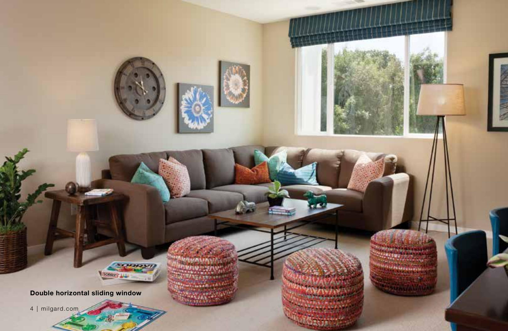
Double horizontal sliding window