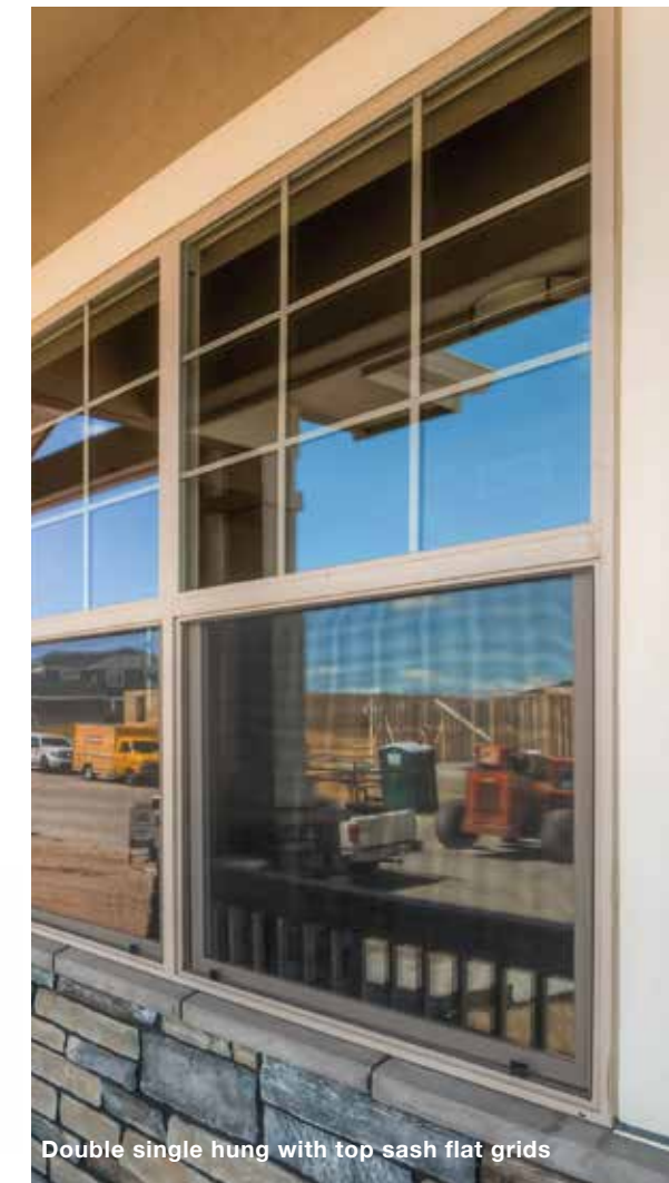
Double single hung with top sash flat grids