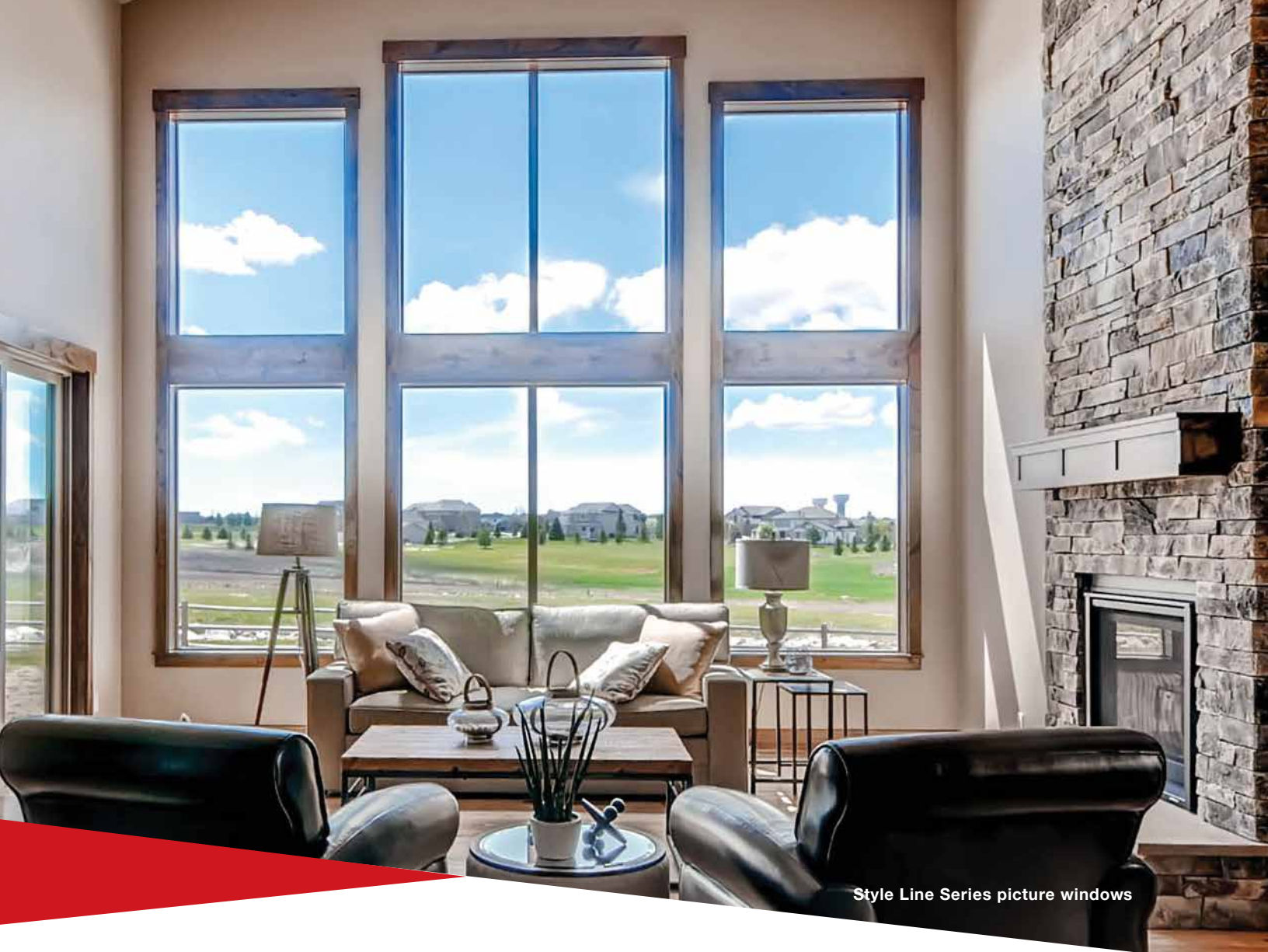
Style Line Series picture windows