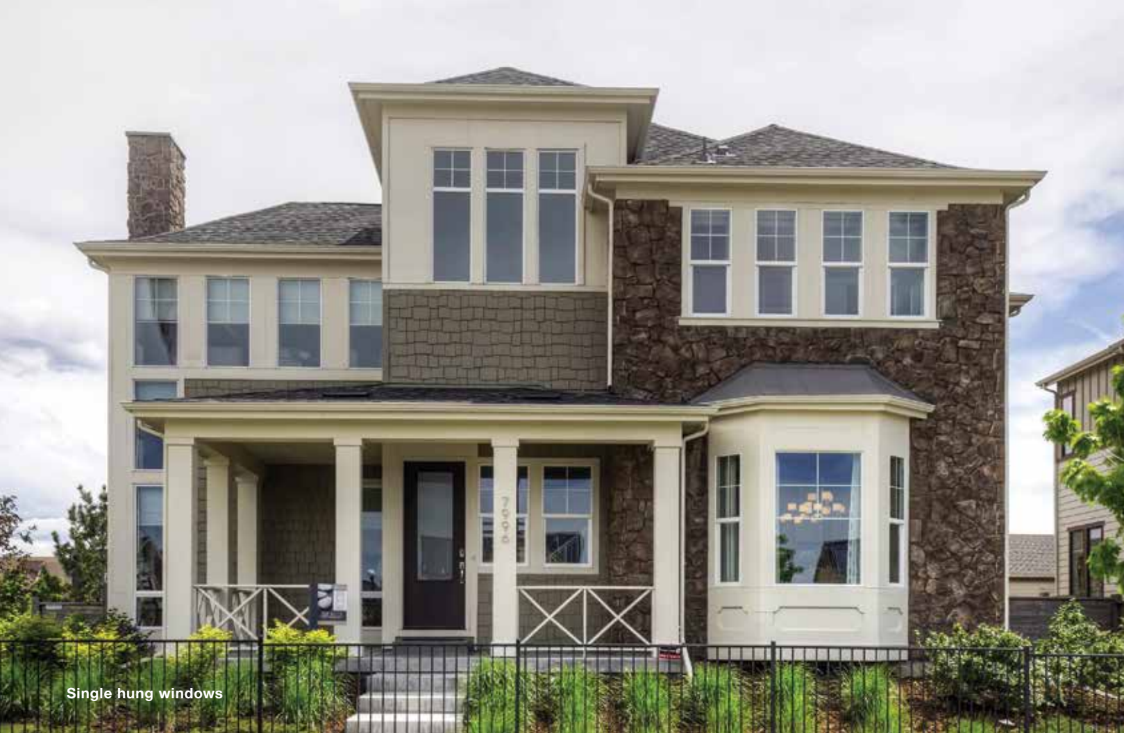
Single hung windows