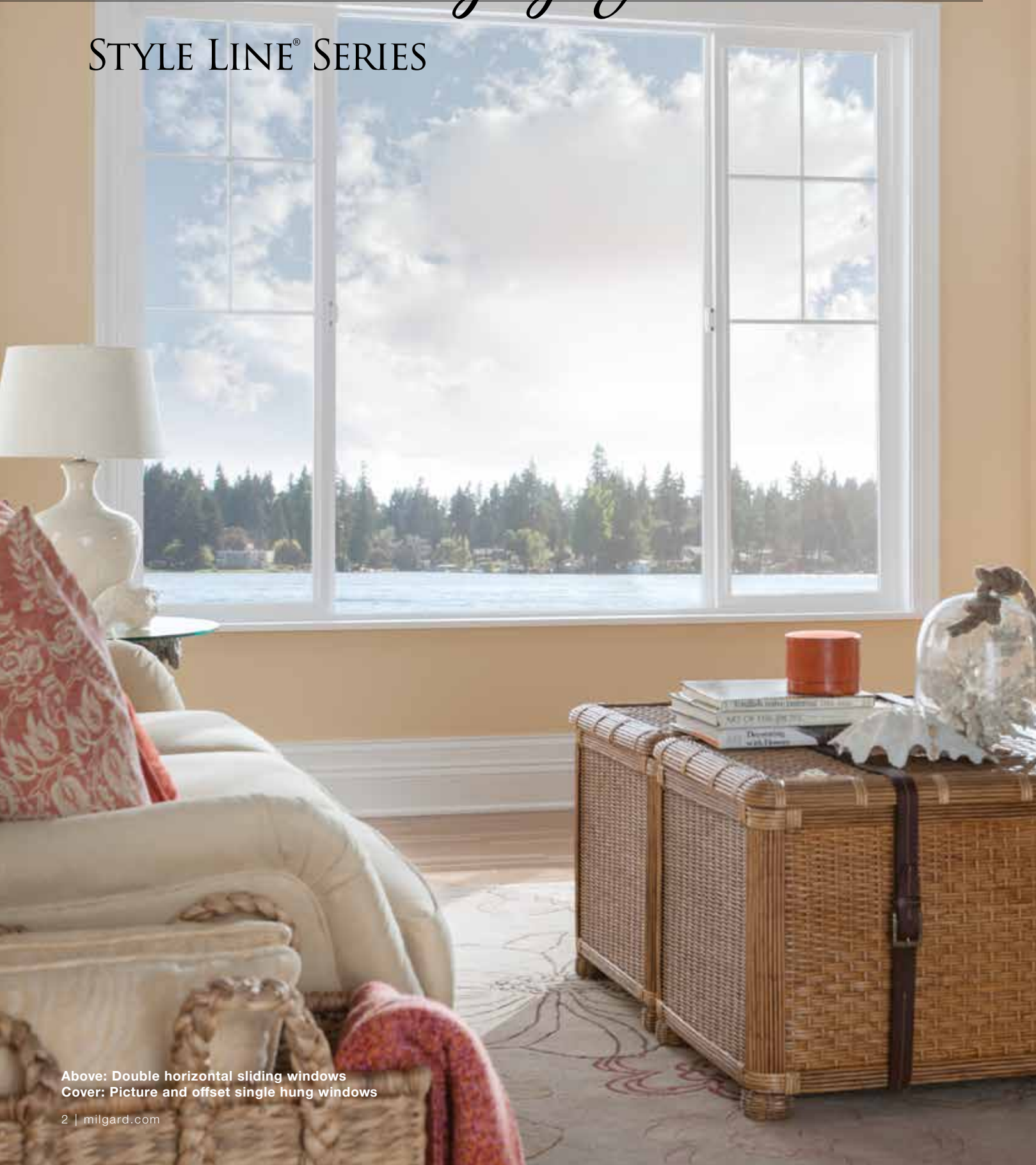
Above: Double horizontal sliding windows Cover: Picture and offset single hung windows