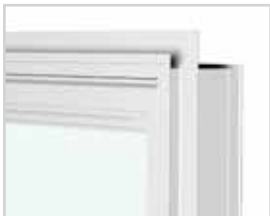
Nailing Fin & J-channel