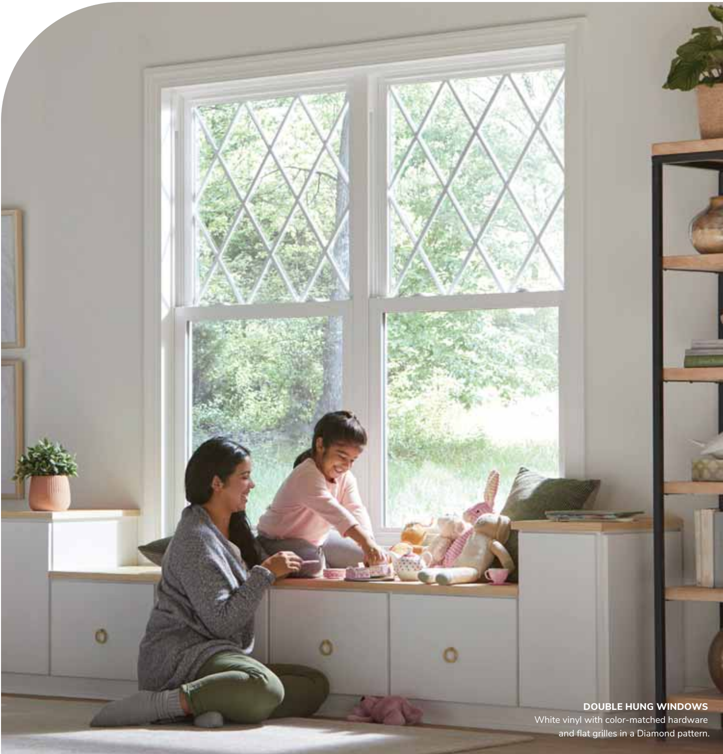
DOUBLE HUNG WINDOWS White vinyl with color-matched hardware and flat grilles in a Diamond pattern.