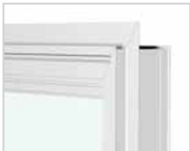
Nailing Fin Only