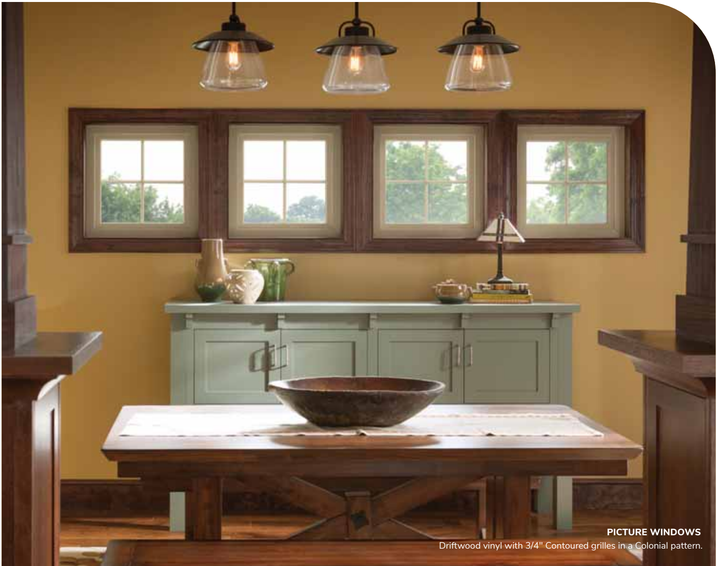
PICTURE WINDOWS Driftwood vinyl with 3/4" Contoured grilles in a Colonial pattern.